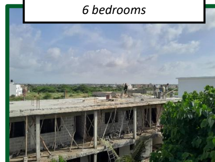
Construction in progress of 6 bedrooms